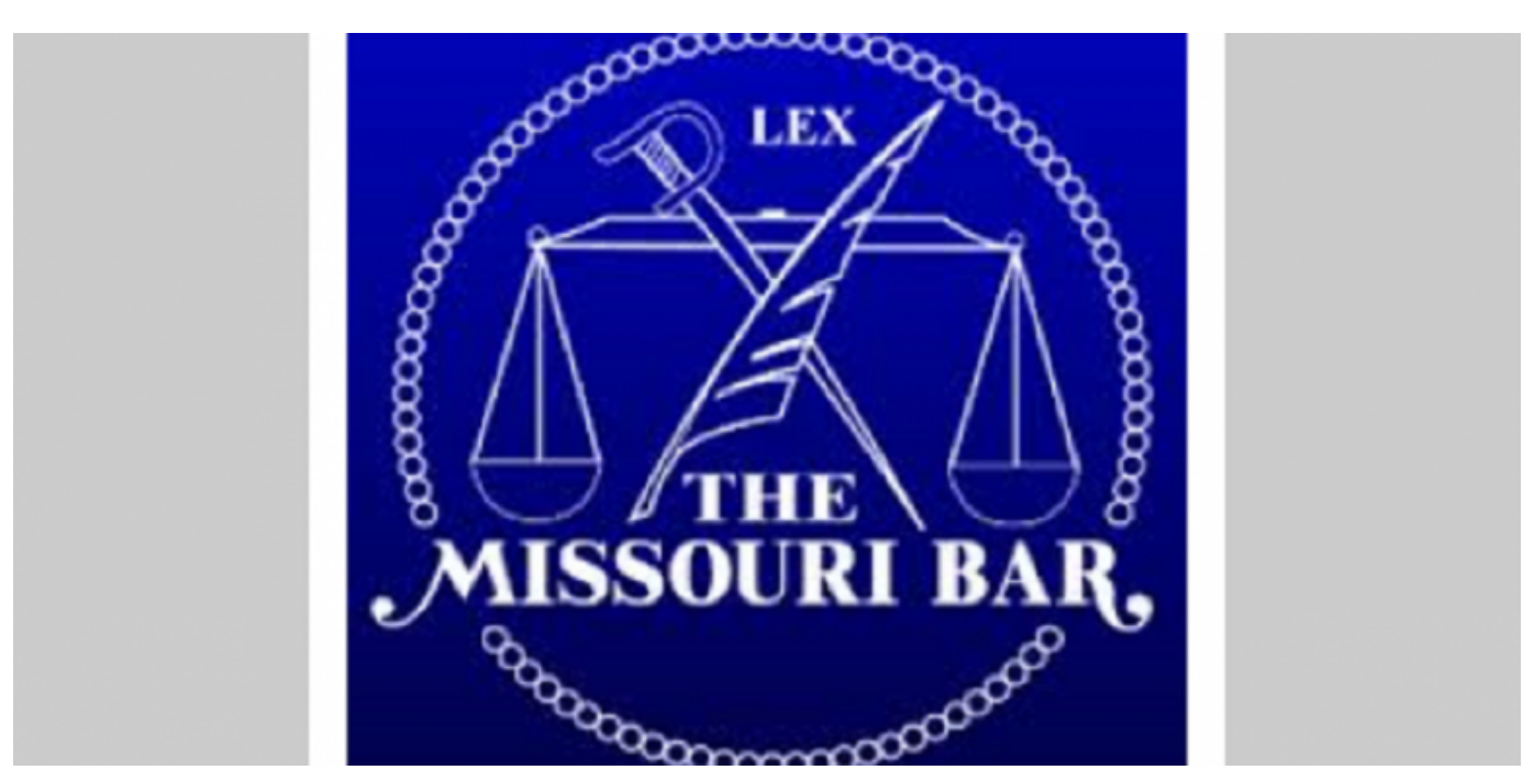
What is Adoption?

Adoption is a legal process that establishes a parent/child relationship between two people who are not otherwise related by blood. There are three sets of participants in an adoption: the petitioners (the adoptive parents, who are seeking to adopt the child); the child to be adopted; and the birth parents (the biological parents of the child to be adopted). Not only does the adoption create a new legal relationship between the adopted parents and the child, but it also severs or terminates any legal relationship existing between the child and his or her biological parents. It is, therefore, a significant legal, financial, social and emotional step for all parties involved.